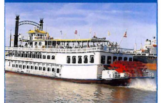
Enjoy a Riverboat Cruise