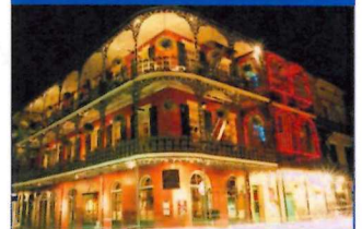
View the French Quarter